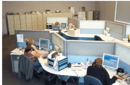
Rescue Alert Response Center