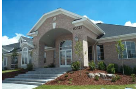
Rescue Alert Front Entrance

Due to significant growth, Rescue Alert has built a new 20,000 + square foot state-of-the-art facility. The transition into the new facility went smoothly, and we are operating at 100%.